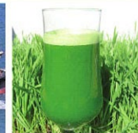
92 WELLNESS THE VEGAN WAY TO HEALTH