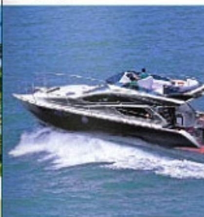
86 NAUTICAL THE NEW LUXURY CATAMARAN