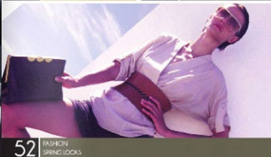
52 FASHION SPRING LOOKS