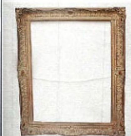
35 ART BILLION DOLLAR BUSINESS OF ART THEFT