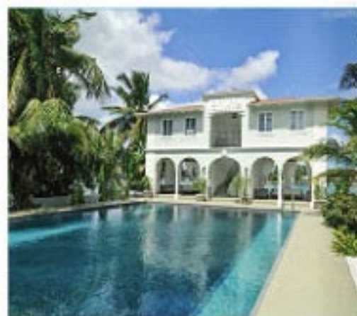
83 REAL ESTATE AL CAPONE'S PALM ISLAND HOME