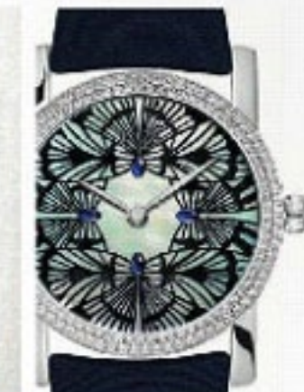
103 CRAFTSMANSHIP ELEGANT WATCHES