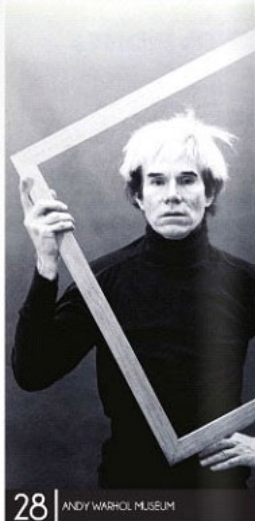
28 ANDY WARHOL MUSEUM

Cover Image: Andy Warhol, July-August 1964 © 1964 THE ANDY WARHOL FOUNDATION FOR THE VISUAL ARTS, INC. / ARTISTS RIGHTS SOCIETY (ARS), NEW YORK